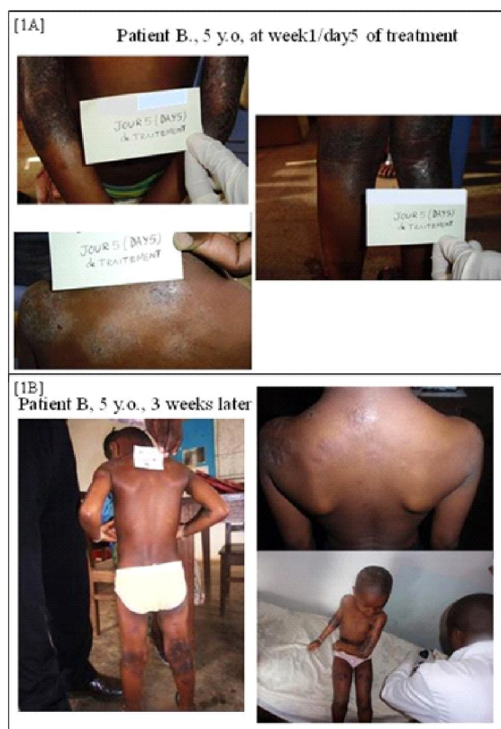
Figure 1A: Affected body areas at day5 (week1) (a) and at day21 (b) after starting topical treatment with 10% Vamex ( Vernonia amygdalina leaf extracts) in a 5-year old Congolese girl

The patient condition got worsened possibly due to lack of adherence to previously prescribed treatments (steroids) rather than their ineffectiveness, which might have made her condition recalcitrant. Furthermore, the use of plant materials that had no proven efficiency by traditional practitioners and healers could have aggravated skin lesions that we observed at the time of patient's admission. Though there were a few dyschromic spots on her lower limbs remaining after 8 weeks of treatment, our patient's condition improved considerably and no adverse effect was noted. An improvement of the country's health system and provision of specialized health care in the rural areas could help prevent misdiagnosis of treatable diseases in poor settings.