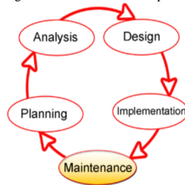
Fig. 2: Model of the systems development life cycle, highlighting the important maintenance phases [12]

will be decreasing and maintenance costs can exceed direct profit gain by owner. Figure 2 shows model of the systems development life cycle, highlighting all the vital maintenance phases [12].