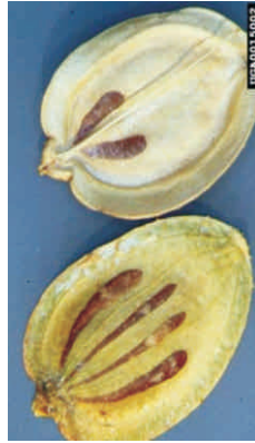
Fig. 4B: Fruit of H. mantegazzianum with oil ducts.