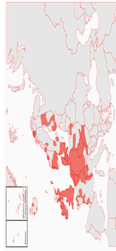
Fig. 7: Distribution of H. mantegazzianum in Europe (2005). ( http://wikipedia.org/wiki/Heracleum_mantegazzianum )