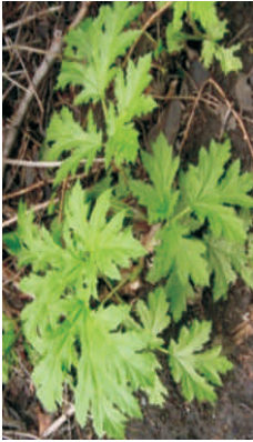
Fig. 2B: Young seedling growth of H. mantegazzianum ( http://www.massnr.org/pests/pestFAQsheets/hogweed.html )