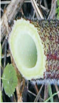
Fig. 3A: Ridges and coarse hairs on hollow stem of H. mantegazzianum .