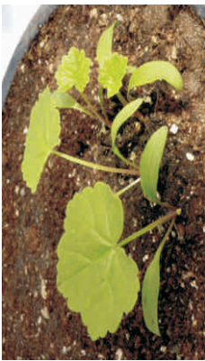
Fig. 2A: Heracleum mantegazzianum seedlings.