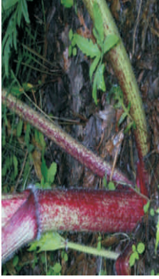
Fig. 3B: Stem of H. mantegazzianum plant with reddish marks.