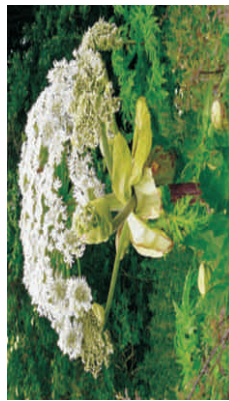
Fig. 4A: Umbel inflorescence of H. mantegazzianum