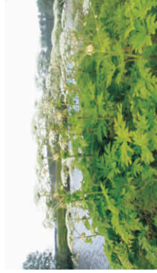
Fig. 5B: Stand of H. mantegazzianum .