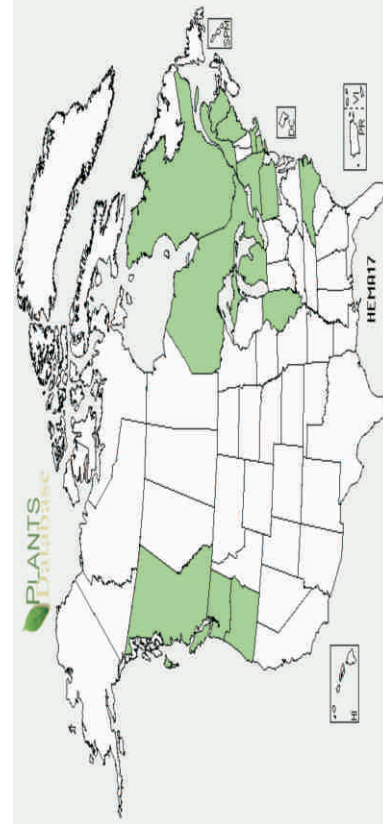
Fig. 6 : Distribution of H. mantegazzianum in North America. USDA, 2015; NRCS-Plant Data Base (as of July 29, 2014).