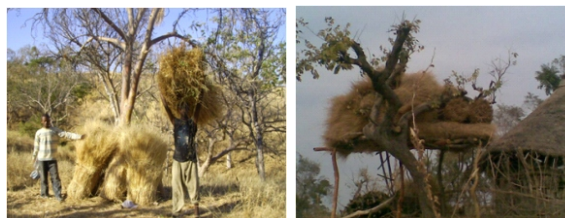
Fig. 3 : Grass collected from the forest and stored around homestead. 2

The entire woodland had tree densities ranging between 200–300 individuals per ha. However, frankincense is collected naturally from the Boswellia papyrifera trees and for many collectors it is the principal source of income. Based on the inventory results, the average Boswellia papyrifera tree density and the quantity of frankincense collected were 225 trees per ha and