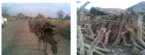
Fig. 2: Fuelwood collections from the forest, and stored around the homestead. 1

Based on the estimate from the field inventory of the woodland, the average fuel wood yield that can be collected/harvested from a hectare of the woodland was estimated to be 4.5 loads ('Shekim'). There is strong seasonality in the collection of fuel wood in the dryland area of the country. For instance, the period December – February is the peak time when farmers collect and stack fuelwoods (Fig. 2). This is because they assume that at this time the dead wood are available for harvesting, and as a result, all farmers collect for