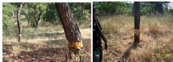
Fig. 4 : Mate Qedem system of claiming land in B. papyrifera dominated woodlands 3 .

According to Dejene et al. (7) much of the lands for farming in the woodland is obtained through informal land holding method and the implication is that “Mate Qedem” system is the deep rooted system for clearing the Boswellia woodland and convert to farmland for cultivation cash crops like sesame and cotton.