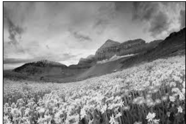
Fig. 3 Himalayan Creative Representation

The best thing you can give to people is your trust. Be open to the people you meet and your conversation will become more meaningful. As life flashed before our eyes, we often realized how little friends we had in our lives. Be more open to people, leave a positive mark in their lives and they will do the same to you.