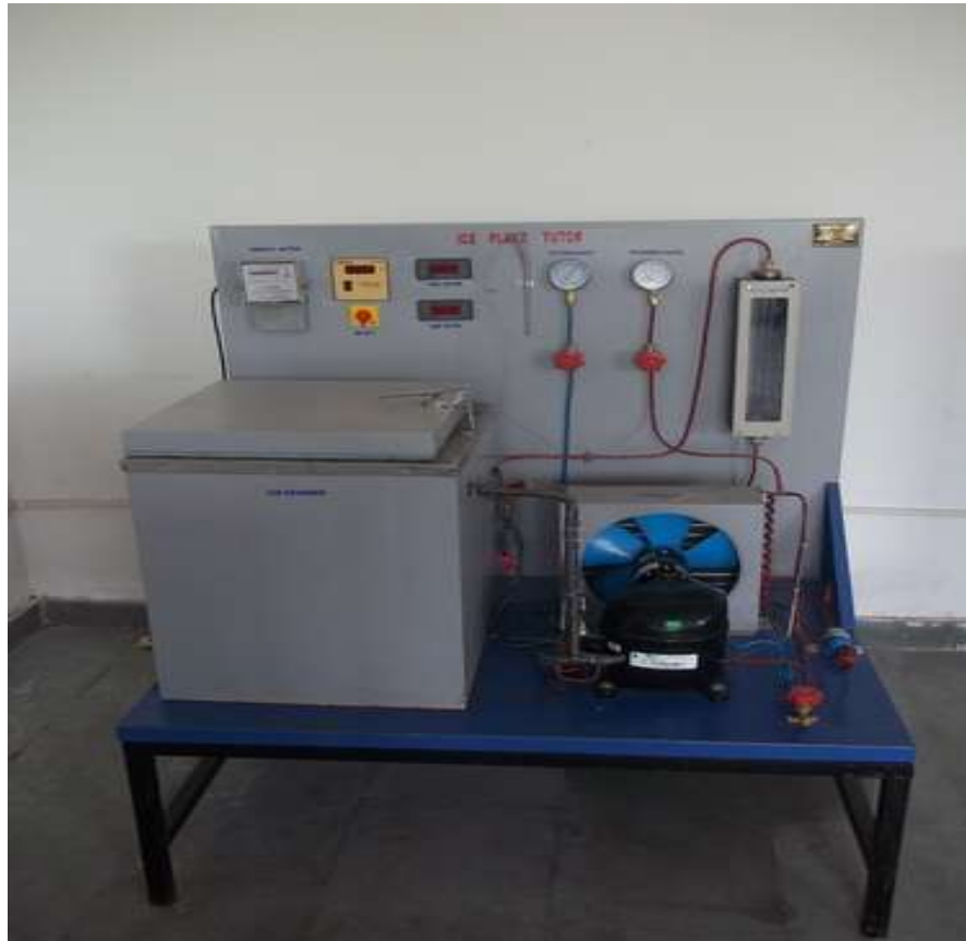
Fig.1. Refrigeration Test Rig