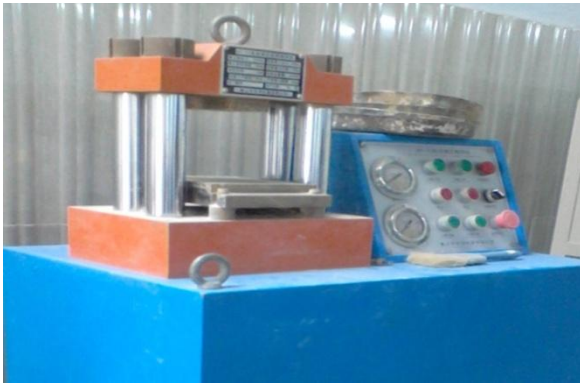
Hydraulic press fig.3