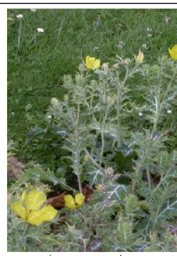
Argemone mexicana (Papaveraceae)