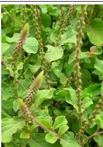
Achryanthes aspera (Amaranthaceae)