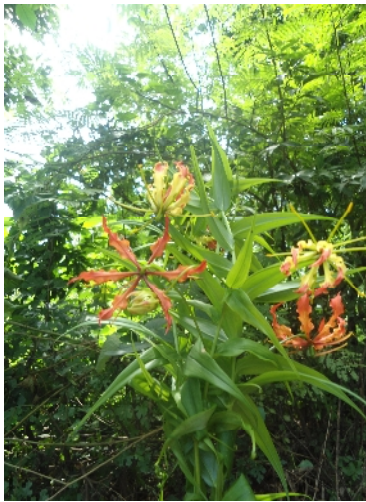
Gloriosa superba Linn. (Liliaceae)