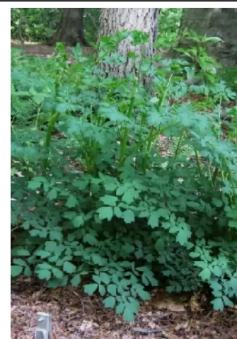
Thalictrum foliolosum DC. (Ranunculaceae)