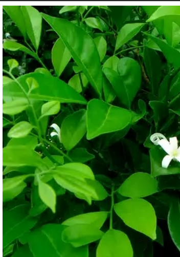
Murraya paniculata (L.) Jack. (Rutaceae)