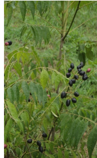
Murraya koenigii Spreng. (Rutaceae)