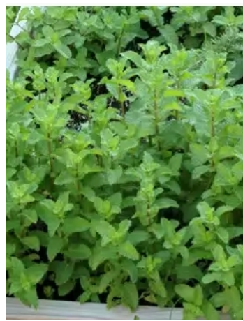
Mentha longifolia (L.) Hirds (Lamiaceae)