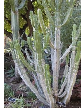
Euphorbia royleana Boiss. (Euphorbiaceae)