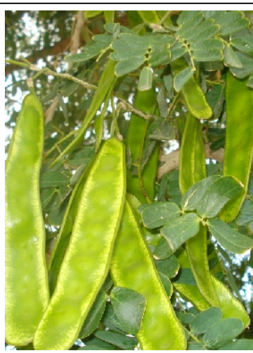
Albizia lebbek Benth. (Mimosaceae)