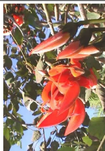
Butea monosperma (Lamk.) Taub. (Fabaceae)