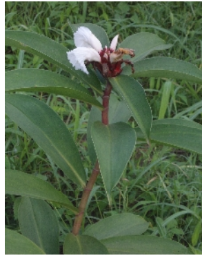
Costus speciosus Smith. (Zingiberaceae)