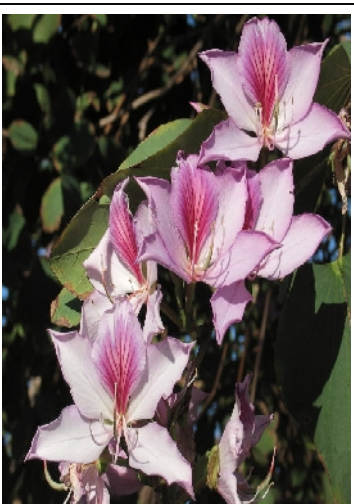
Bauhinia variegata Linn. (Fabaceae)