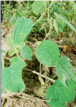
Cissampelos pareira Linn. (Menispermaceae)