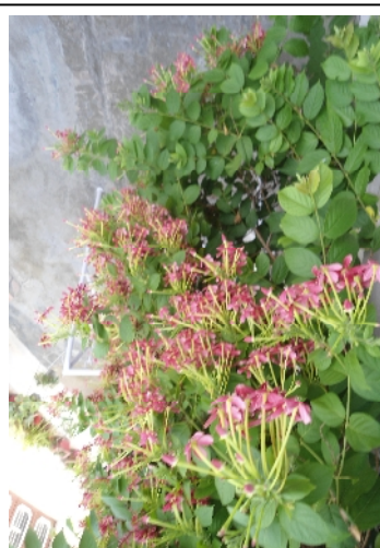
Rauvolfia serpentina Benth. Ex Kurtz. (Apocynaceae)