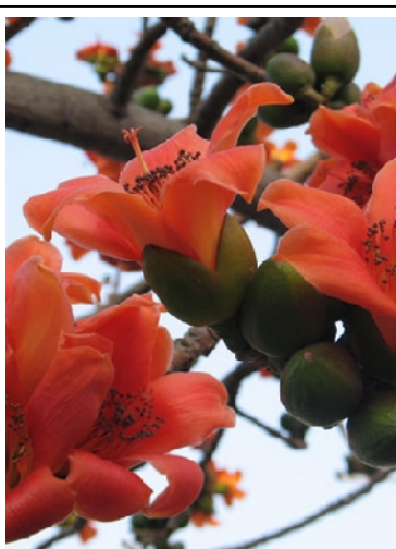
Bombax ceiba L. (Bombacaceae)