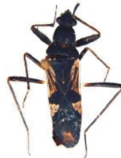
Metochus uniguttatus (Thunberg)