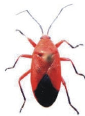
Antilochus coqueberti (Fabricius)