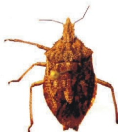
Halys dentatus Fabricius