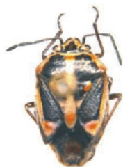
Bagrada picta Fabricius