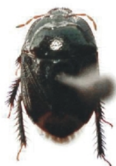
Cydnius indicus Westwood