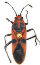
Spilostethus hospes (Fabricius)