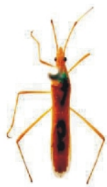
Leptocorisa varicornis (Fabricius)