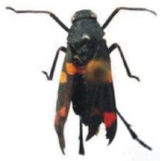
Calittix varicolor (Fabricius)