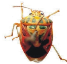
Antestia cruciata Fabricius