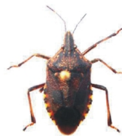
Erthesina fullo (Thunberg)