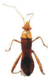
Riptortus fuscus (Fabricius)