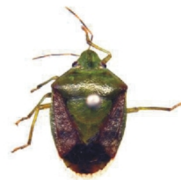
Plautia fimbriata Fabricius