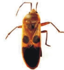
Physopelta gutta Burmeister