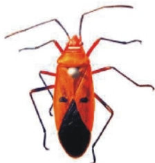
Dysdercus koenigii (Fabricius)