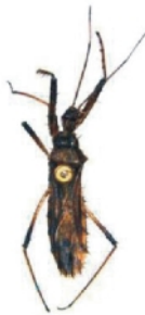
Polididus armatissimus Stal