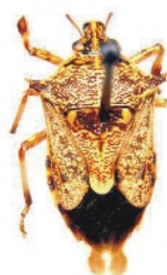
Canthecona frucellata Wolff