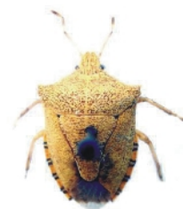
Degonetus serratus Distant