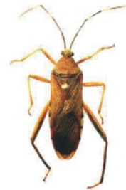
Notobitus meleagris (Fabricius)