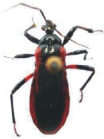
Ectrychotes disper Reuter