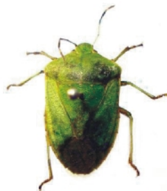
Nezara viridula (Linnaeus)