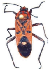
Spilostethus pandurus militaris (Fabricius)