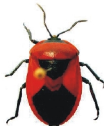
Coridius ianus (Fabricius)