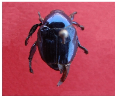
Popillia cyanea Hope