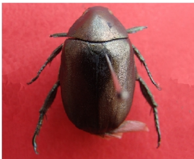
Anomala cantori (Hope)