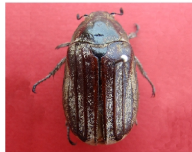
Melolontha cuprescens Blanchard