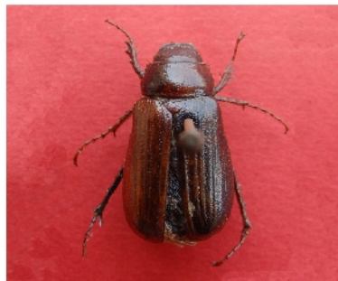
Holotrichia longipennis Blanchard