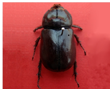
Oryctes nasicornis (Linnaeus)