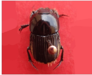
Oniticellus (Oniticellus) cinctus (Fabricius)