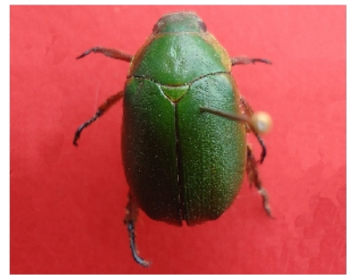
Mimela passerinii Hope