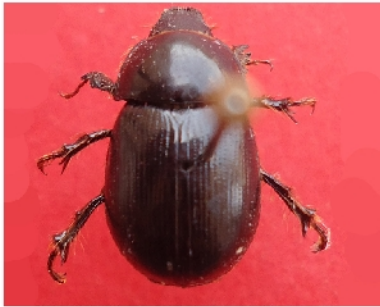
Hybosorus orientalis Westwood