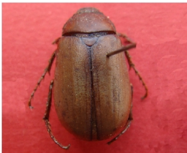
Hilyotrogus holosericeus Redtenbacher