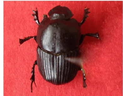
Liatongus gagatinus Hope