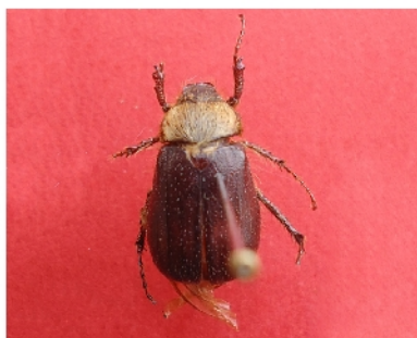
Brahmia crinicollis Burmeister