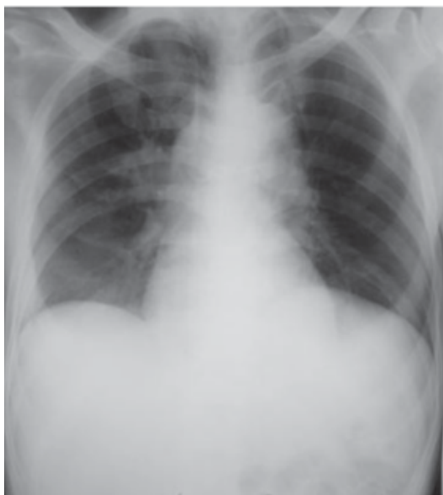
Figure 5: Control PA chest X-ray after antibiotics.

was sent for microbiological examination. Blood cultures were cultivated in the automated BacT/Alert system using both anaerobe and aerobe liquid media. The instrument indicated positive cultures after the 24 hour-incubation. Gram staining of the liquid cultures revealed short Gram-positive bacilli. The blood cultures were subcultured on the blood agar and MacConkey agar in aerobic conditions and on Shaedler agar in anaerobic conditions. After 48h of incubation on the blood and Shaedler agar, a noticeable growth was registered. Colonies were small, smooth and slightly whitish. Gram stain of the culture revealed Gram-positive short rods resembling diptheroids in pattern. The oxidase and catalase tests were performed, producing a negative