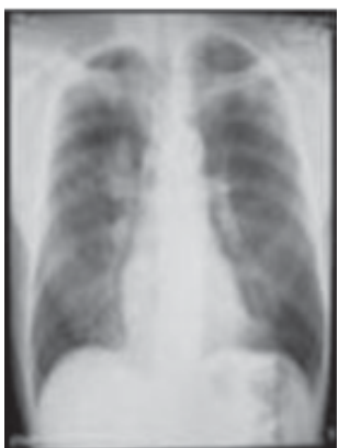
Figure 1: PA chest X-ray at the first day of hospitalization.

A 62-year male patient was admitted to hospital to enlighten the etiology of the lesion presented on his chest X-ray, localized in the right upper lobe. He reported a two-month history of back pains, fatigue, exhaustion, appetite and body mass losses (8 kg in two months). Having noticed a tumorous lesion on the patient's chest X-ray (Figure 1, 2), chest computed tomography (CT) was performed delineating an infiltration of 27 mm in