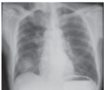
Figure 4: PA chest X-ray with pneumonic shadow.

was sent for microbiological examination. Blood cultures were cultivated in the automated BacT/Alert system using both anaerobe and aerobe liquid media. The instrument indicated positive cultures after the 24 hour-incubation. Gram staining of the liquid cultures revealed short Gram-positive bacilli. The blood cultures were subcultured on the blood agar and MacConkey agar in aerobic conditions and on Shaedler agar in anaerobic conditions. After 48h of incubation on the blood and Shaedler agar, a noticeable growth was registered. Colonies were small, smooth and slightly whitish. Gram stain of the culture revealed Gram-positive short rods resembling diptheroids in pattern. The oxidase and catalase tests were performed, producing a negative