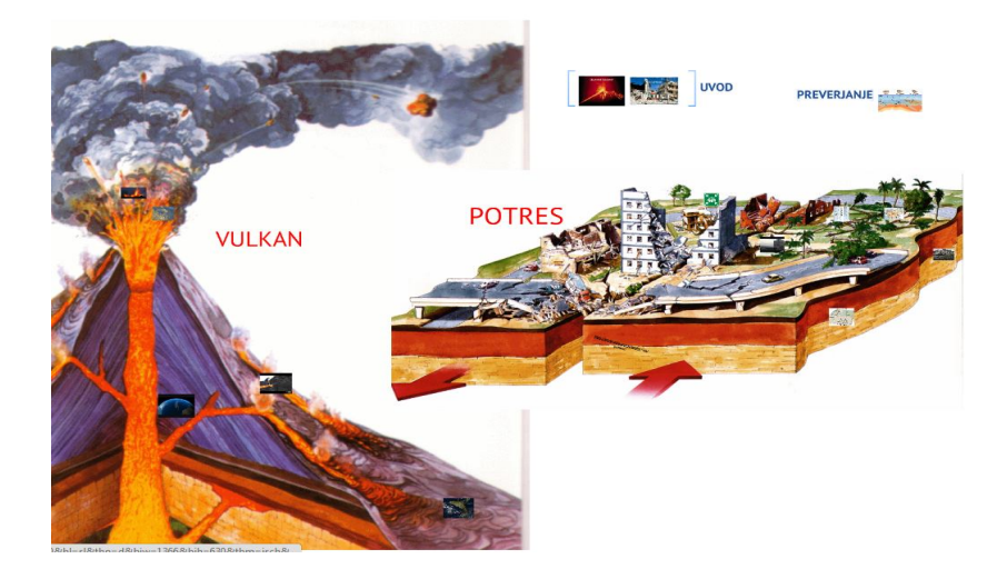
Picture 1: Introductory motivation (Vrhunec, Prezi presentation, 2014).

The experiences have shown that the pupils find this theme fascinating, so it is divided into two lessons. During the second lesson the pupils make a paper model of a volcano.