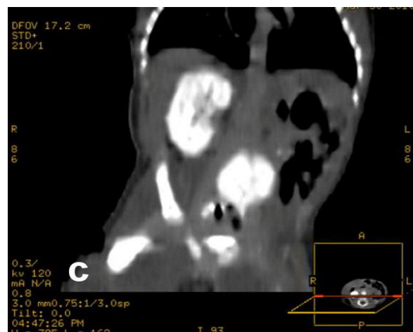
Fig. 2. (a) Normal testes, (b) IVU contrast in bladder and rectum and, (c) ectopic left kidney.