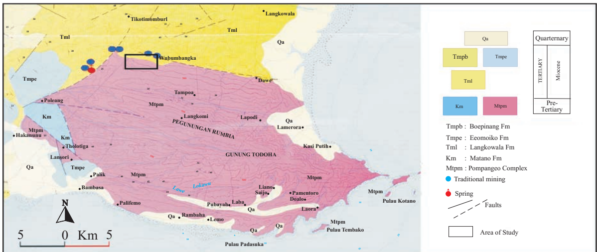
Figure 2. Geological map of Langkowala area occupied by Langkowala Formation (Tml) unconformably overlying Paleozoic metamorphic rocks (Pompangeo Complex; Mtpm) in the south (Wumbubangka and Rumbia mountain range) (Modified from Simandjuntak et al. , 1993).

of River Tahi Ite in 2008, and more than 20,000 traditional gold miners have been operating in the area (Kompas Daily, 2008). During January 2009, the number of traditional gold miners in Bombana Regency increases significantly and reaching the total of 63,000 people (Surono & Tang, 2009). The secondary gold is not only found in present stream sediments (placer), but also found within Miocene sediments of the Langkowala Formation (paleoplacer). The primary source of Bombana placer/paleoplacer gold is in controversy and it is still opened for discussion. This paper describes a preliminary study on possible primary deposit type as a source of the Langkowala (Bombana) secondary placer gold. This study is an important stage for the next exploration of gold in the area or other areas that have an identical setting of geology.