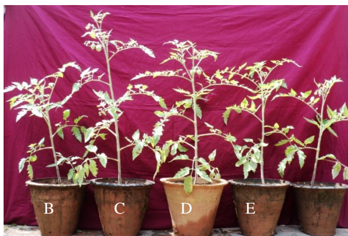
Figure 1: Showing symbiotic response of Rhizophagus fasciculatus , Gigaspora margarita , Sclerocystis dussi and Acaulospora laevis on plant growth of Solanum lycopersicum L., (Var. Vaibhav).