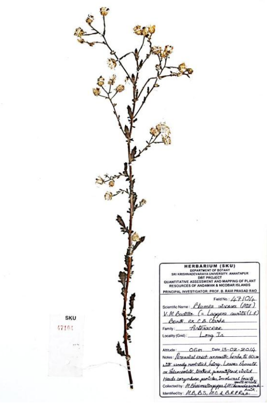
Fig.4.Herbarium specimen of Blumea viscosa