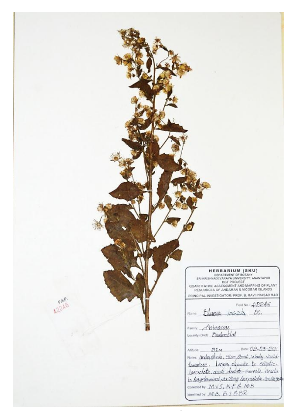
Fig.3.Herbarium specimen of Blumea laciniata