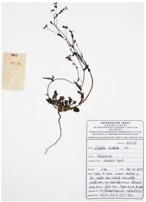
Fig. 5. Herbarium specimen of Emilia scabra

Perennial herb with long woody cylindric rhizome, to 4-25 cm high; stem simple, often with many flowering branches from the base, sometimes solitary. Leaves chiefly radical, linear or spathulate, 5 x 1 cm, base cuneate, apex acute, margin denticulate or sub entire. Heads cylindric, subpaniculate on bracteolate peduncle. Involucral bracts in 2 rows, obovate or linear-lanceolate, glabrous, membranous towards margins. Ligule yellow. Achenes pale yellowish, darker between the ribs, ellipsoid, subcompressed, 5 mm long, contracted at both ends, strongly ribbed. Pappus silvery white longer than achenes.