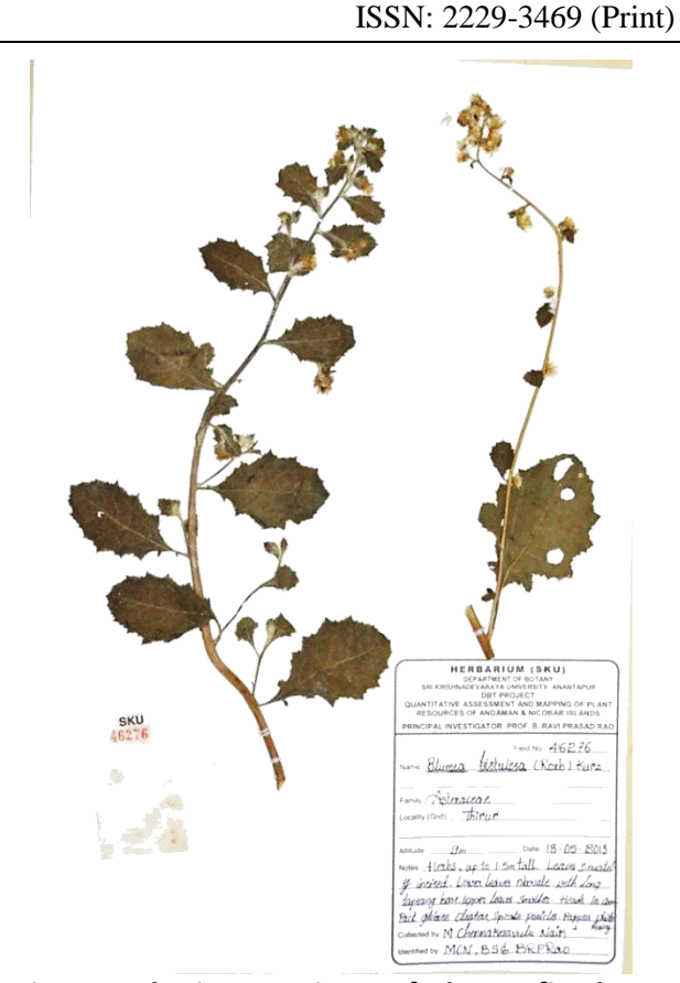
Fig. 2. Herbarium specimen of Blumea fistulosa