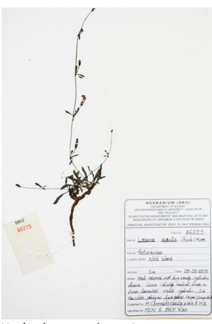
Fig.6. Herbarium specimen Launaea acaulis

Distribition: India: Jammu & Kashmir, Himachal Pradesh, Uttar Pradesh, West Bengal, Orissa and Madhya Pradesh. World: Afghanisthan, Pakisthan, Nepal and Iran.