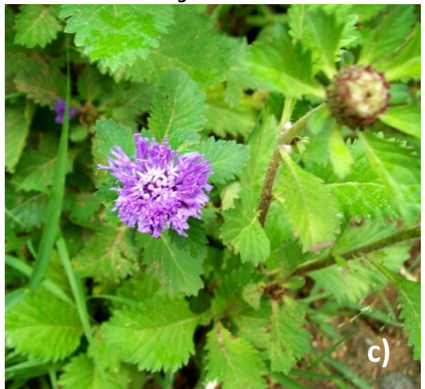
Centratherum punctatum Cass.