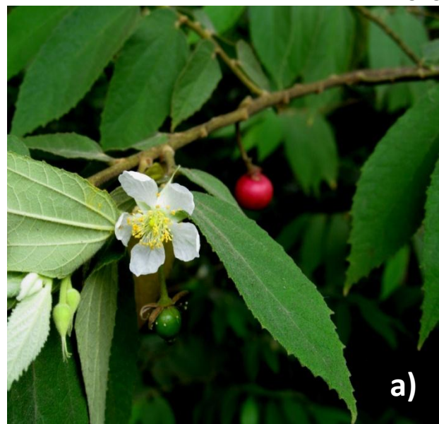
Mutingia calabura L.