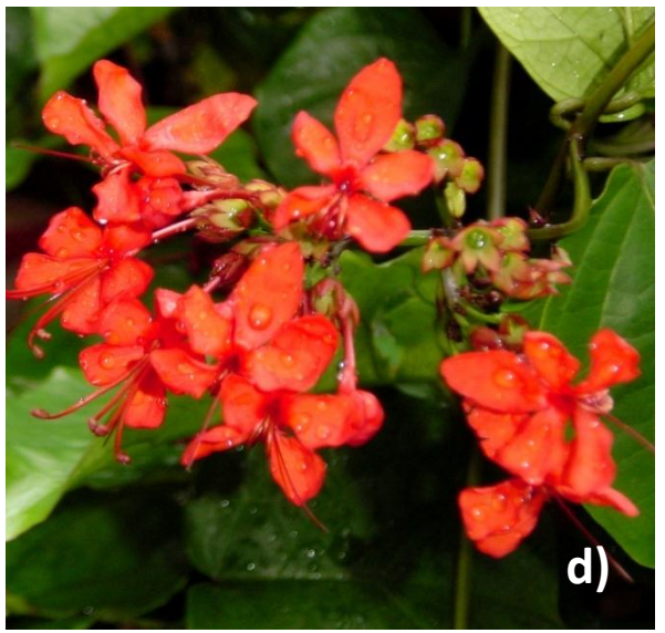
Clerodendrum splendens G. Don

obliquely rounded at base, serrate at margins, 3-5 nerved, hairy on upper surface, woolly below. Flowers white, solitary or in pairs. Berries glabrous, ripens pinkish-red. Seeds numerous.