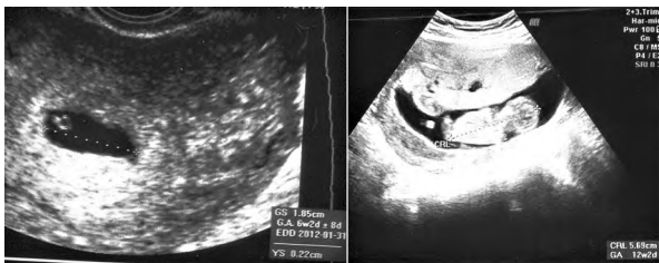
Fig 3: First trimester ultra-sound of partly molar change accompanying a normal fetus in family (S).

Ultrasound on her first trimester, illustrated a singleton pregnancy by an irregular gestational sac. In serial ultra-sound, the placenta has been larger with cystic area sounds like molar changes with large bilateral ovarian cysts, most probably theca lutein cysts (Fig 3). Amniocentesis of amniotic fluid in 17 weeks showed a normal XX female karyotype.