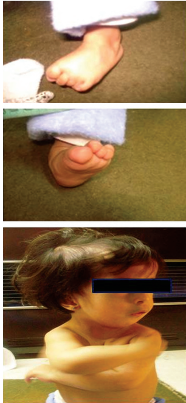
Fig 1: Examination revealed evidence of generalized weakness with reduced muscle tone and diminishment. Patient was unable to walk unassisted and also had difficulty sitting.

some diatonic features in the distal parts of the extremities. Due to muscle weakness in the lower limbs, the patient was unable to walk unassisted and also had difficulty in sitting (Fig 1).