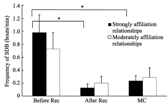
Figure 3 The effects of opponents with different affiliation relationships on self-directed behavior frequency before reconciliation and after reconciliation

Female Tibetan macaques showed significantly higher SDB rates while proximity to dominants than subordinates, which may be resulted from the strict dominance hierarchy. Aggression among Tibetan macaques is directed predominantly down the hierarchy (Li, 1999), thus a dominant partner will present more danger of receiving aggression than a subordinate partner, and increased anxiety should be expected. The SDB rates is