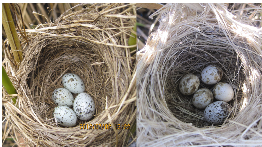
Figure 2 Nests of Oriental Reed Warbler (left) and Reed Parrotbill (right) parasitized by common cuckoo eggs (the larger egg in each nest)

(34.3%) of Oriental Reed Warbler was recorded in ZL, with 4.1% of multiple parasitism. By contrast, the lowest value was found in CM, with 22.4% of parasitism rate and no cases of multiple parasitism. The multiple parasitism rates were positively correlated with the local parasitism rates across three geographic populations of Oriental Reed Warbler (Spearman's rho; r_{sp}=1.00 , n=3 , P<0.01 ). Parasitism rates were much lower in Reed Parrotbill, with 3.6%, 0% and 4.6% in ZL, YRD and CM, respectively. No multiple parasitism was found in Reed Parrotbill nests at the three sites.