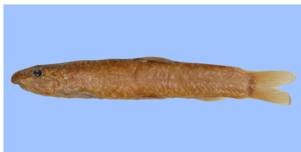
Figure 12 Barbatula caudofurca , syntype, DVZUT, 53.4 mm SL, lateral view

Unfortunately, the six extant syntypes of Barbatula caudofurca Mai, 1978 are devoid of any color pattern, except a dark, broad, continuous basicaudal bar (Figure 12). All other diagnostic features present in the type material are also found in the Damahe River material, and as far as I can interpret, the original description and its accompanying figure these features are also present in P. hagiangensis . Therefore, P. hagiangensis is put objectively in synonymy of S. caudofurca .