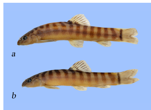
Figure 14 Schistura tamduongensis , lateral view; a. Paratype, LC.09.03.005, 60 mm SL, reversed; b. Paratype, LC.09.03.003, 50.9 mm SL

This species has been described from a stream called Ban Bo in Tam Duong district, Lai Chau Province. The Ban Bo is a minor tributary to the Mu River, a left bank affluent of the Black River in Son La Province. The holotype LC.09.03001 has a SL of 66.6 mm and was collected together with 13 paratypes (LC.09.03002-14; 20.2–61.5 mm SL). The jar containing the type series is equipped with a printed label and is stored in HNUE. The specimen depicted in the original description is not the holotype, but a paratype, LC.09.03005, 60 mm SL.