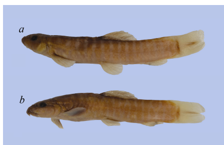
Figure 13 Schistura pumatensis , lateral view; a. Holotype, PM020170, 64.2 mm SL, reversed; b. Paratype, PM020172, 57.7 mm SL

This species is described from the Khe Bu stream in the Pumat National Park, Nghe An Province. The Pumat National Park is chiefly drained by the Lam River. The HNUE placed type series consist of one holotype (PM020170; 64.2 mm SL) and five paratypes (PM020171-75; 54.8–59.6 mm SL), collected on 2006-7-12.