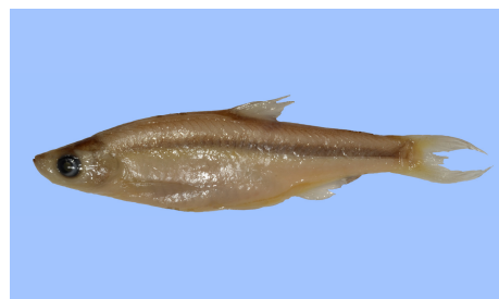
Figure 5 Toxabramis nhatleensis , paratype, HNUE, 61.6 mm SL, reversed, lateral view

Key diagnostic features of T. nhatleensis are lvs 39–41; gill rakers on the first branchial arch 27–35; and posterior edge of dorsal spine with 11–13 serrations. I have examined a 61.6 mm SL paratype, which is depicted herein (Figure 5). Although it is objectively a valid species within Toxabramis , the ventral keel in T. nhatleensis does not reach pectoral fin origin.