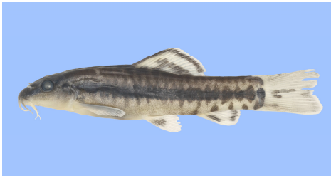
Figure 10 Traccaticthys pulcher , KIZ2012000177, 53.9 mm SL, lateral view