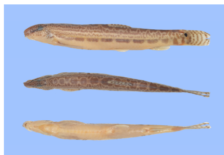
Figure 1 Cobitis ylengensis ; RIA1, 82.7 mm SL, lateral, dorsal and ventral view

Province. This central province is chiefly drained by the coastal Gianh River. The type series has the Lot number 501 of RIA 1. It was contained in a jar and carried a clean, printed label. There were eight untagged specimens in the jar, while the original description gives four type specimens (Ngo, 2003). After evaluating the batch, one 82.7 mm SL specimen was examined, measured and photographed. Since the figure accompanied with the original description is less informative, the examined specimen is figured here (Figure 1). It could not be clarified if this specimen belongs to the type series. Kottelat (2012) treats C. ylengensis as a valid species, which is corroborated herein.