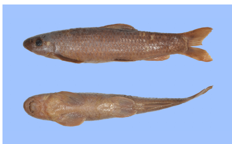
Figure 6 Vinagarra laichowensis , paralectotype, RIA 1, LC.65.01.002, 73.3 mm SL, lateral and ventral view