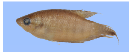
Figure 18 Macropodus oligolepis , holotype, 37.6 mm SL, lateral view

The jar of RIA 1, Lot number 406, contained a single 37.6 mm SL specimen of M. oligolepis (Figure 18). It carried a printed label with the in blue ink hand written collection number P.02.01.06 (2). Following the RIA 1 standard of collection numbers, this number identifies the jar content as two paratypes. According to the original description, the type series of M. oligolepis consists of a 38 mm SL holotype and a single 21 mm SL paratype. Hence, the located specimen is the holotype. The whereabouts of the other specimen were reportedly unknown. M. oligolepis is described from the Phong Nha-Ke Bang National Park in Quang Binh Province (Nguyen, Ngo & Nguyen in Nguyen, 2005b).