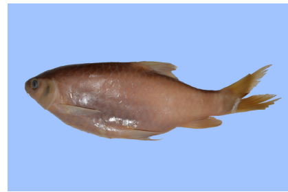
Figure 3 Spinibarbus maensis , holotype, HNUE, 261 mm SL, lateral view

The original description (Nguyen et al in Duong et