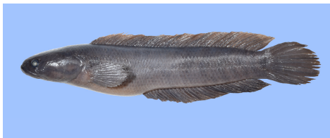
Figure 16 Channa hoaluensis , paratype, NB. 10.05.002, 214 mm SL, lateral view

In the absence of a code-conform original description, the name C. hanamensis is treated as a nomen nudum with provisions as specified herein.