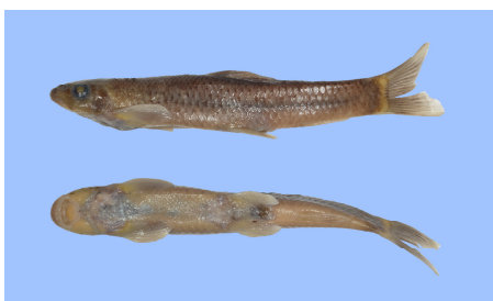
Figure 7 Vinagarra elongata , paratype, RIA 1, 61.4 mm SL, reversed, lateral and ventral view

yellow notepad with blue ink, hardly discernible hand writings acting as a provisional label glued on the jar containing the type series. The collection manager confirmed the jar's content to be the concerned type material. The original description is accompanied by a distorted photograph (Nguyen & Bui, 2010, Figure 1). Although the TL and SL in the figure's caption fit to the examined specimen, they do not resemble each other. It is also unclear, whether the depicted specimen is the holotype. The examined 61.4 mm SL, untagged specimen (Figure 7) was in poor condition, soft, with adpressed and torn fins, and with a cavernous visceral cavity. It is assumingly a paratype.