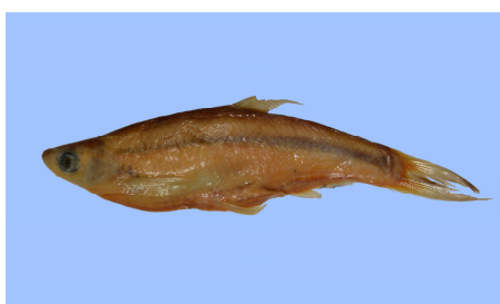
Figure 4 Toxabramis maensis , paratype, HNUE, 74.8 mm SL, reversed, lateral view

This species has been described from the Ma River basin as the specific epithet implies. The original description (Nguyen & Duong in Duong et al, 2006) based on a 72 mm SL holotype and six paratypes (68–82 mm SL). The holotype and three paratypes were collected from Quan Hoa district in Thanh Hoa Province on 2003–10–18. The residual type material was collected from Thieu Hoa district in the same province on 2004–06–15. There was a printed, clean label affixed to the jar containing the type series which is placed in HNUE. There was neither a repository specimen number nor a Lot number on the label. Besides, all specimens were untagged.