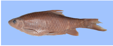
Figure 2 Poropuntius aluoiensis , holotype, HNUE VI.1.I.21, 193.8 mm SL, lateral view

paratypes (133–140 mm SL [the SL of the largest paratype is given as 40 mm, which I consider to be an inadvertent typing error, and thus corrected it to 140 mm]). The type series is stored in HNUE. The jar containing the holotype bore the number VI.1.I.21. The specimen displayed in the original description (Nguyen, 1997; freshly dead specimen) is assumingly the holotype. It is clearly the specimen that I have examined and is depicted herein (Figure 2). It shows the damaged upper caudal fin lobe and the curved abdomen in the prepelvic portion as the specimen I have examined. I have measured its SL to 193.8 mm.