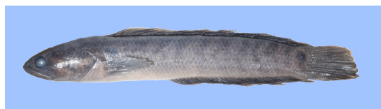
Figure 15 Channa hanamensis ; holotype, H.Na.10.02.001, 226 mm SL, reversed, lateral view