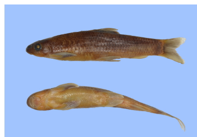
Figure 8 Vinagarra tamduongensis , holotype, RIA 1, LC.06.05.012, 72.7 mm SL, lateral and ventral view