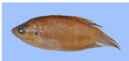
Figure 19 Macropodus phongnhaensis , paratype, 38.3 mm SL, lateral view

This taxon was also described from the Phong Nha-Ke Bang National Park in Quang Binh Province. The original description (Ngo, Nguyen & Nguyen in Nguyen, 2005b) based on a 40 mm SL holotype and three 36.2–38 mm SL paratypes. A jar (RIA 1, lot number 405) with damaged printed label containing two specimens of M. phongnhaensis and two juvenile barbines was presented. The label bore the hand written number P.02.01.04 (4). The specimen in better condition was examined (Figure 19, 38.2 mm SL). By judging from the overall body and finnage appearance, this specimen should be the largest paratype and seems to be the specimen displayed in Nguyen (2005b). The whereabouts of the holotype were reported unknown.