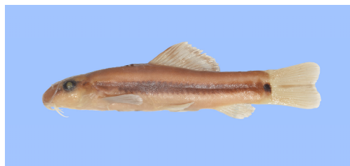
Figure 9 Micronemacheilus bacmeensis , neotype, RIA 1, N.01.25.001, 59.5 mm SL, lateral view, reversed