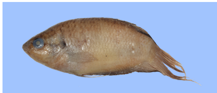
Figure 17 Macropodus lineatus , holotype, 47.8 mm SL, reversed, lateral view

The taxon is described from five specimens, a 51.5 mm SL holotype and four paratypes ranging from 37–47 mm SL. The type location is Phong Nha-Ke Bang National Park, Quang Binh Province. The jar containing the type material, lot number 408, carried a printed label. There was a hand written collection number using blue ink on the label, P.02.01.05(5). The five in parentheses indicate the number of specimens in the jar and is congruent with the original description (Nguyen, Ngo & Nguyen in Nguyen, 2005b). However, there were only four specimens in the jar. After examining the type material, the largest specimen (47.8 mm SL) of the batch was identified to be the specimen depicted in the original description Nguyen, Ngo & Nguyen in Nguyen (2005b,