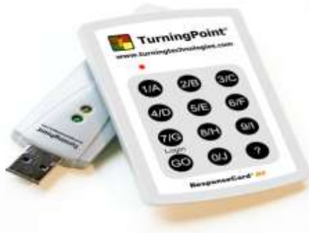
Figure 1. The receiver and Clicker

Clickers are used under such names as electronic polling systems (EPS), electronic voting machines (EVM), personal response system (PRS), classroom response systems (CRS) and audience response systems (ARS). Clickers is a set of hardware and software that can be used in classroom environment as a part of teaching activities and in which students respond to questions appearing on a screen through a hand-held remote (see figure 1).