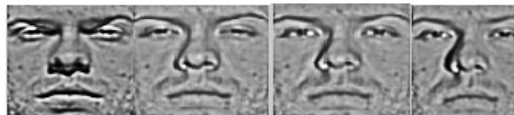
Figure 1f: Weber Faces