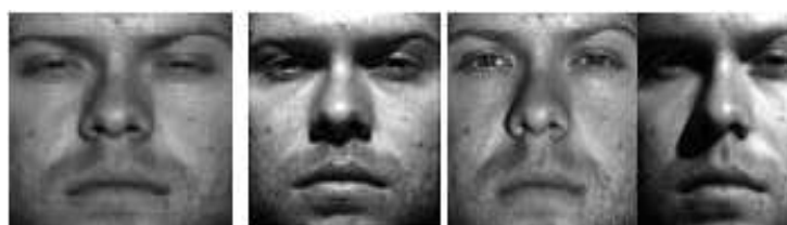
Figure 1a: Images under Different Illumination from Extended Yale B Database

These images are normalized using the techniques namely DCT normalization, Wavelet Denoising, Gradient Faces, Local Contrast Enhancement and Weber Faces. Figure 1 shows the images after illumination normalization by different methods.