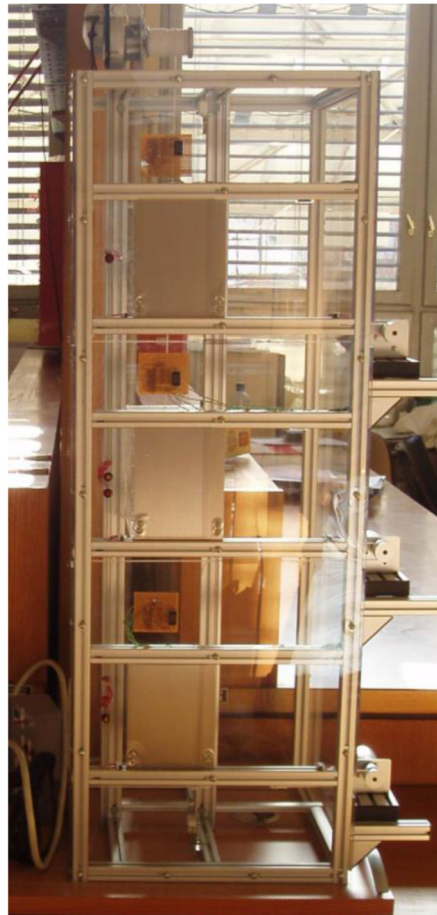
Figure 1: Profile construction of the personal lift.

Students reported that working on this project, they acquired theoretical and practical knowledge, manual skills and learned about teamwork, thus acquiring extensive experience that they will need while working for a company.