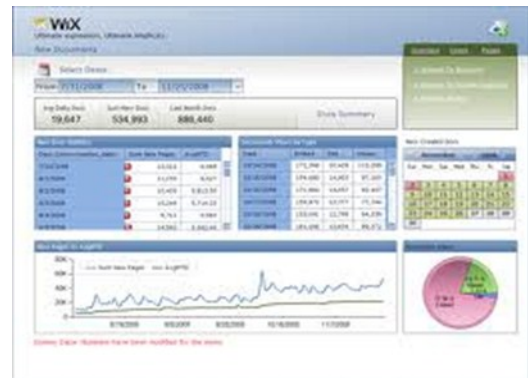
Fig. 2- Web Analytics Dashboard

Dashboards are a powerful way of monitoring websites and distributing information to different target groups. However, they can be difficult to design, because successful designs require deep insight into the needs of the target groups as well as into the field of web analytics.