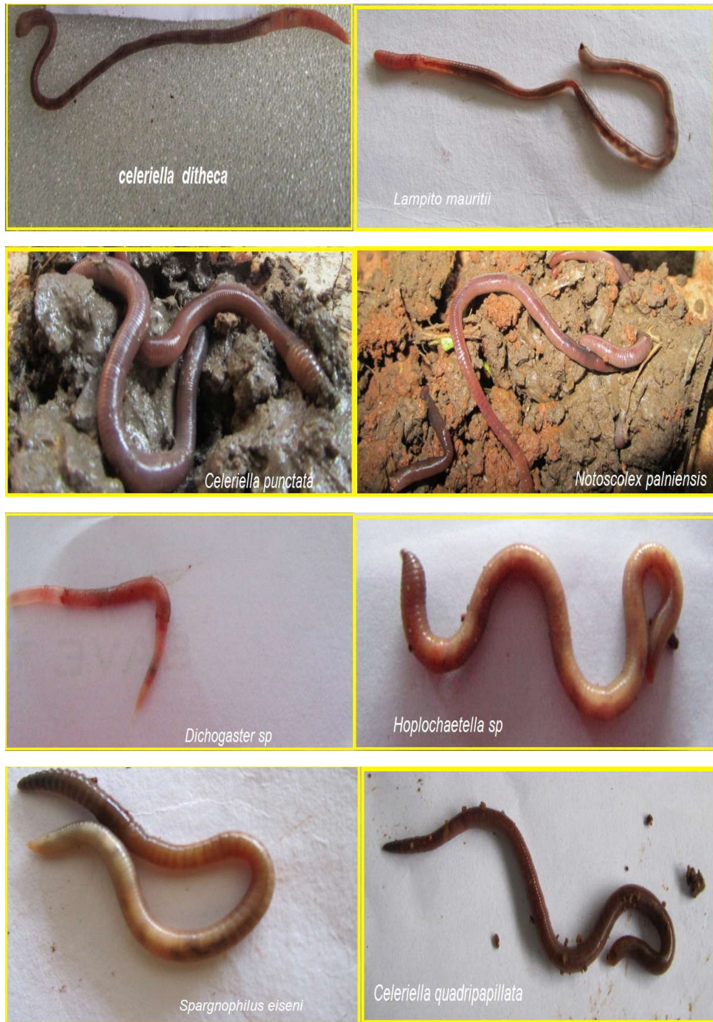
Figure 2. Identified earthworm species