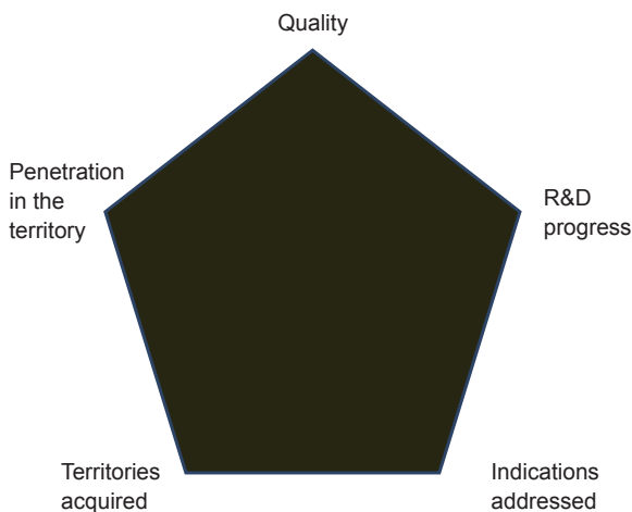
Figure 1: Strategic priorities of the company