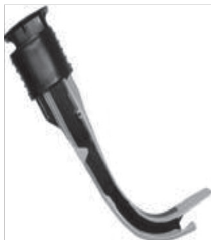
Figure 2: Airtraq optical laryngoscope