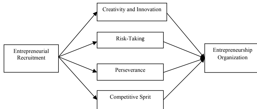
Figure 3. The related model

To do the research, the researcher needed a model which is presented below and confirmed by the related experts.