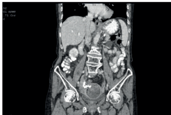
Figure 4. CT scan. A broad fistulous tract on the right lateral wall of the uterine cavity, possibly between the appendix and the uterus.

24 hours and had a favorable evolution, with rapid remission of the postoperative ileus and tolerance of food intake. On day 5 post-op, the patient had an accidental fall causing a left neck of femur fracture, for which she required left lower limb immobilization with a Dessault bandage.