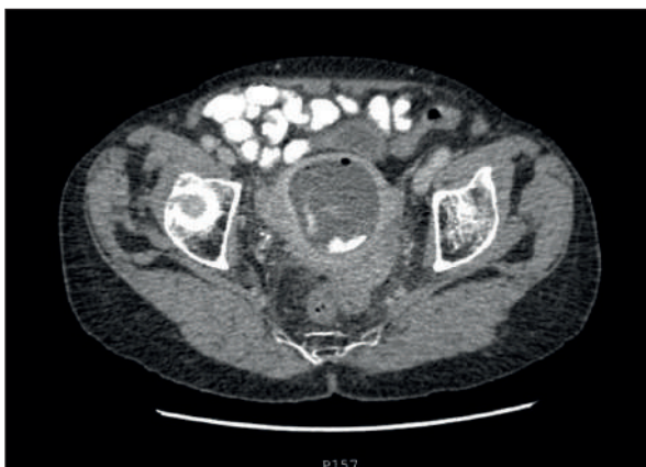
Figure 1. CT scan showing a significant enlargement of the uterine cavity filled with fluid, air and oral contrast.

We decided to proceed with urgent surgery through a pubio-umbilical median laparotomy. Intraoperatively, the uterus was enlarged, hyperemic, elastic, with a retro-uterine inflammatory mass incorporating the posterior wall of the uterus, the right adnexa, the cecum, portions of the small bowel and the sigmoid. After careful adhesion-lysis and release of the sigmoid colon and the small bowel, a fistulous tract was identified between the appendix and the uterine cavity, prompting total hysterectomy with bilateral adnexectomy and appendicectomy. Postoperatively, the patient was admitted to the Intensive Care Unit for