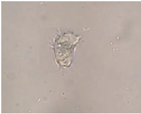
Figure 2: Light microscopy images of Acanthamoeba spp. trophozoite isolated from mucosal tissue of malignant patients in hospitals of Zanjan, Iran Acanthamoeba trophozoite in saline (40X)

Therefore, the presence of Acanthamoeba spp. in various environmental resources should be considered a significant health concern, especially for high-risk populations such as immunocompromised patients and contact lens users [6, 20].