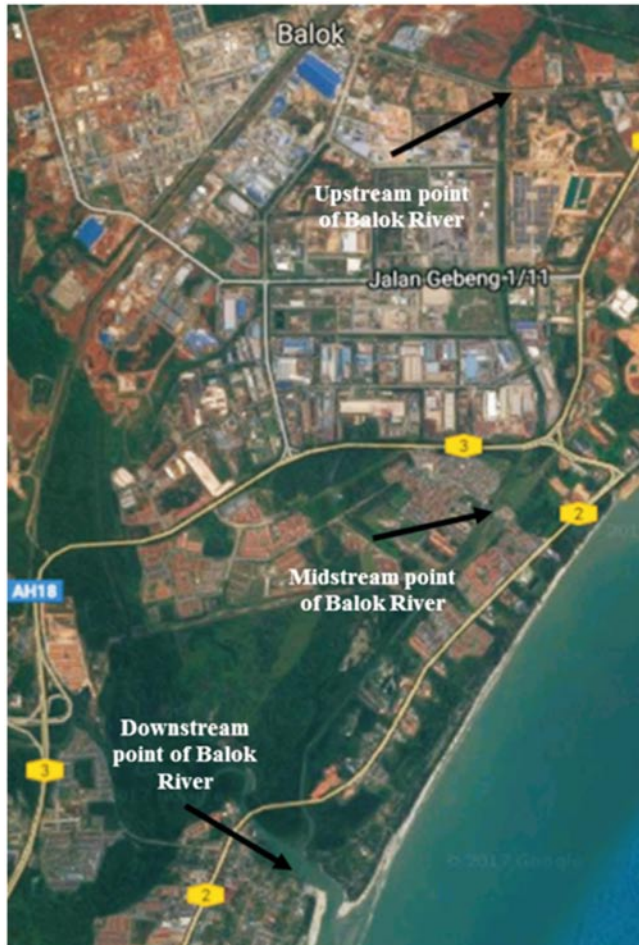
Figure 2. Water sampling sites of upstream, midstream and downstream points in Balok River.

GPS location: downstream point of Balok River (3.938092, 103.376077); midstream point of Balok River (3.961288, 103.387420); upstream point of Balok River (3.987227, 103.388099).