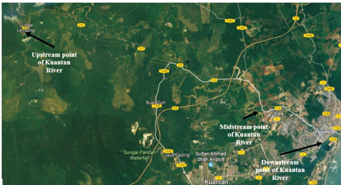
Figure 1. Sampling sites of upstream, midstream and downstream points in Kuantan River.

DNA extraction from river water sample was carried out by using QIAamp DNA Mini Kit (QIAGEN, Germany) referring to manual