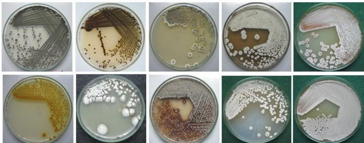
Figure 1: Representative Actinomycetes from Estuaries of Uttara Kannada District