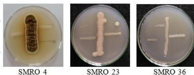
Figure 4: Antifungal activity of some Actinomycetes isolates

The primary screening of the isolates showed marked inhibition of the yeasts and dermatophyte. The antagonistic activity was measured as the interaction between the actinomycetes isolates and the test organisms. 32 isolates showed maximum inhibition of C. neoformans (74.41%). 27 isolates showed inhibition of C. albicans (62.79%). 10 isolates showed least inhibition of Trichosporon (23.25%). Isolate no SMRO 8, SMRO 14, SMRO 15, SMRO 18, SMRO 40 and SMRO 41 were ineffective against the yeast and dermatophyte tested (Table 5; Figure 4).