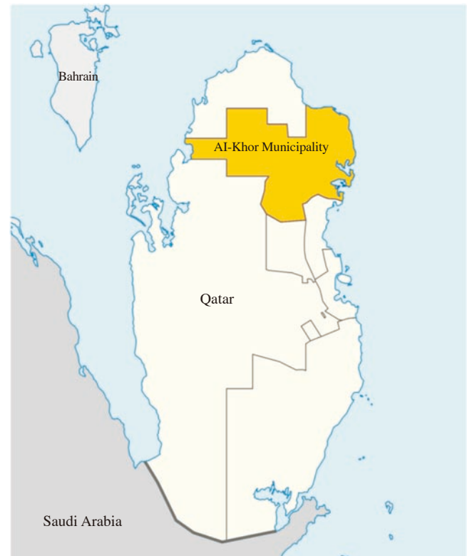
Figure 1. A map of the state of Qatar showing the north-eastern district.

were collected by a standard dipper (about 300 mL each), and five dips were taken from each site. The collected larvae were fixed in 70% ethyl alcohol, labeled and stored in glass bottles for lab identification. Larvae were identified by using the standard identification keys[9-12]. Some larvae were kept alive and allowed to raise up in the lab to obtain the adult stages, especially those related to Cx. pipiens complex.