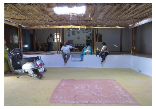
Figure 4.