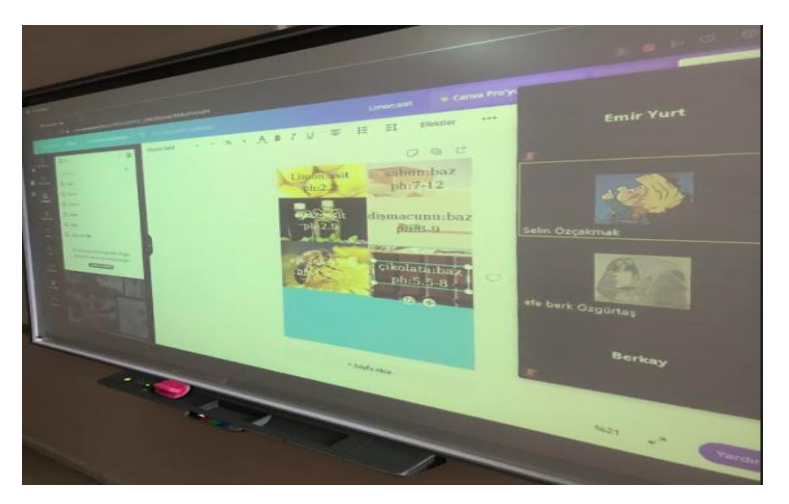
Figure 3. An example of in-class activities