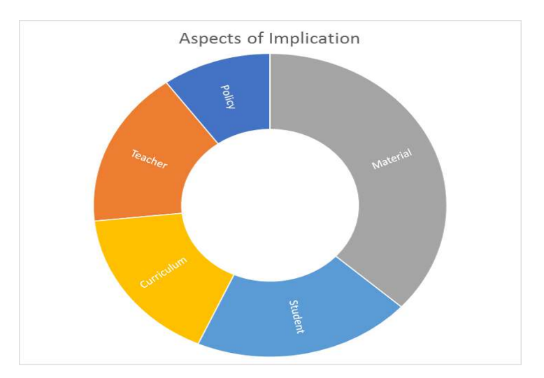
Figure 3. Implications of digital citizenship in civic education

On the aspect of student implications, a survey study conducted on high school students revealed that students lacked an understanding of digital citizenship practice, namely, only 37.1% of students. The study also showed that students use of mobile devices had increased, which led to the need for monitoring by parents and students. On the material aspect, Choi (2016) research investigated democratic citizenship education in the internet era by examining the concept of digital citizenship. In this study, researchers analyzed the contribution of digital citizenship to students' democratic attitudes in the internet era.