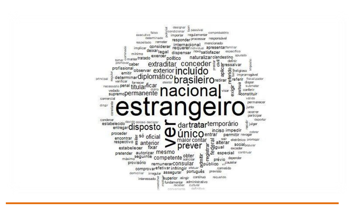
Figure 01. Word Cloud (Foreigner Statute)*

national (73 times), extradite (23 times), expulsion (22 times), extradition (22 times), prison (21 times), deportation (20 times), crime (18 times), residency (16 times), and asylum (10 times) (Figure 01).