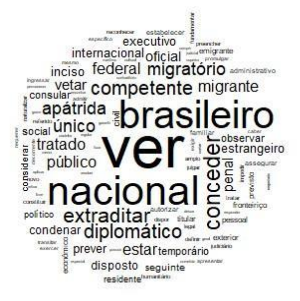
Figure 02. Word Cloud (Migration Law)*

Convention on Human Rights in the Foreigner Statute, nor does the Migration Law mention it.