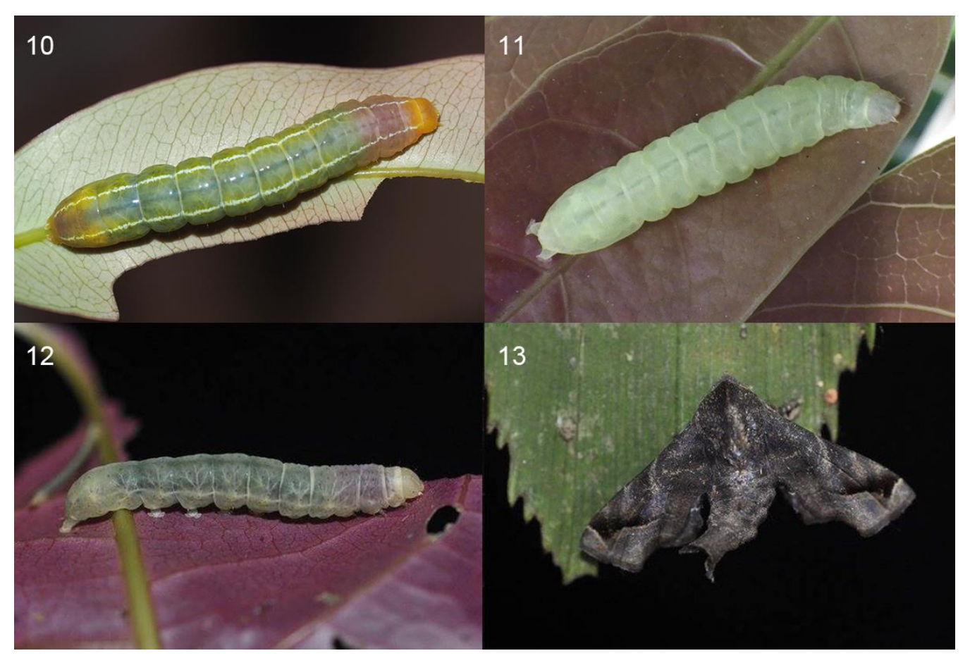
Figures 10–13. The Euteliinae in Taiwan and Kinmen. 10-12. Immature stage; 13. Adult. 10. T. delatrix (Guenée, 1852), Taiwan; 11. ditto, Kinmen; 12–13. Penicillaria jocosatrix Guenée, 1852, Taiwan.