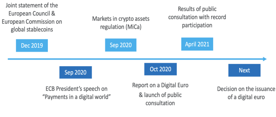
Figure 2. Digital Euro Timeline.

to manage the amount of digital euro in circulation, were also highlighted. The majority of respondents were men (87%), citizens of Germany (47%), Italy (15%), and France (11%), with the remaining Member States accounting for between 1% and 5% of the total.