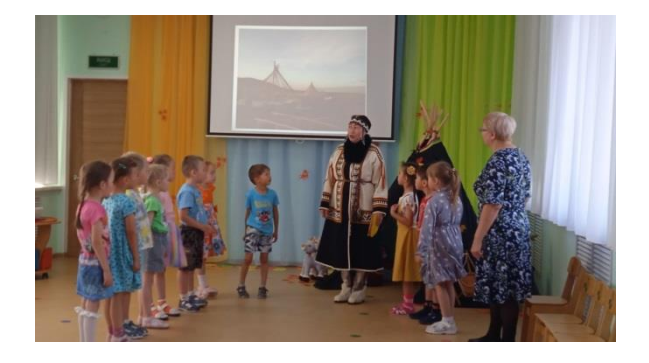
Fig. 5. Attending a Nenets language class in a kindergarten in the Krasnoe village.