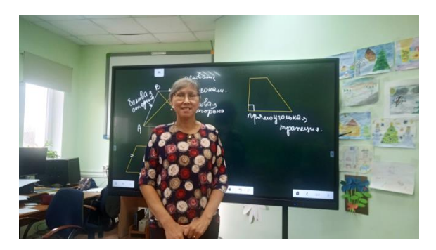
Fig. 7. Visit to a school in the Andeg village.