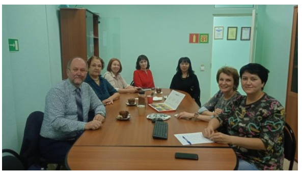
Fig. 10. Summing up the results of the expedition at the Education Development Center of the Nenets Autonomous Okrug with the Senator of the Russian Federation Galushina R.F.