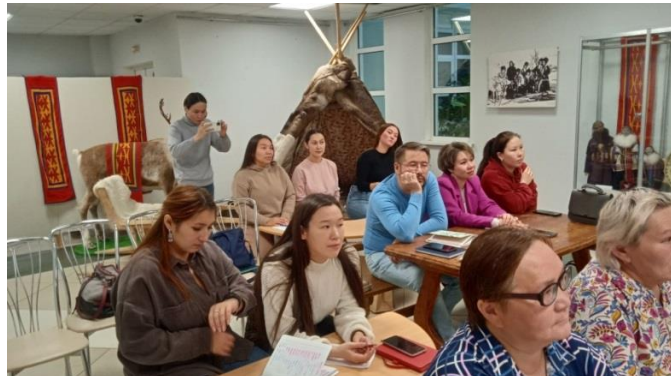
Fig. 2. Nenets language class at the school of the Ethnocultural Center of the Nenets Autonomous Okrug.