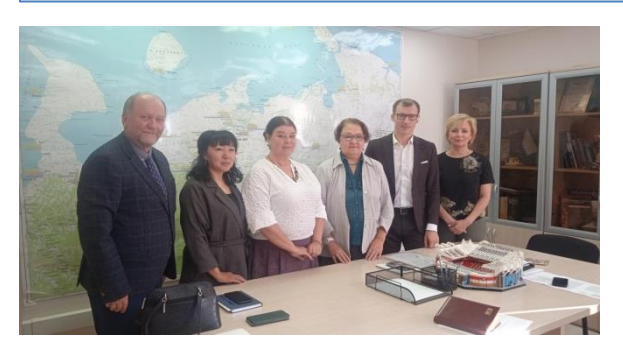
Fig. 3. Meeting at the Department of Education, Culture and Sports of the Nenets Autonomous Okrug, September 27, 2022.