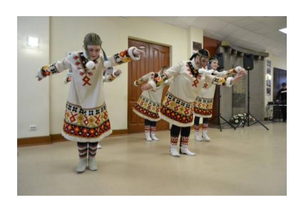
Fig. 19. Nenets dance "Masters" performed by the ensemble "Zindegi" <sup>13</sup>.