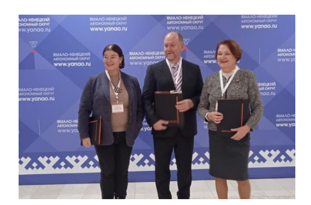
Fig. 11. At the conference in Salekhard.

The results of monitoring studies carried out in the Nenets Autonomous Okrug are presented in scientific reports by members of the NArFU research group at the interregional scientific and practical conference "Civilization — North: languages and cultures of indigenous peoples of the North" (Salekhard, October 30–November 2, 2022).