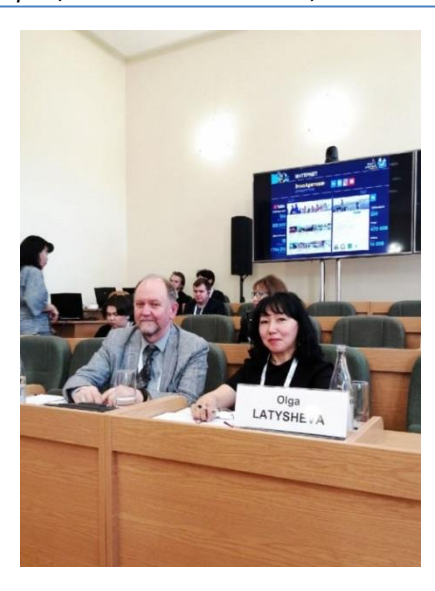
Fig. 13. At the international seminar in St. Petersburg (RSPU, March 16–18, 2022).