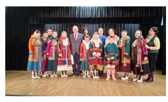
Fig. 4. Meeting with artists of the Nenets amateur theater "Ilebts" (Naryan-Mar).