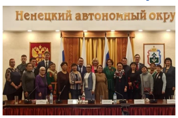
Fig. 16. Participants of the round table in Naryan-Mar.

At the round table meeting "Preservation and development of the Nenets language in the Nenets Autonomous Okrug" in Naryan-Mar on December 5, 2022, a group of NArFU scientists from among the participants of the project "Preserve the Nenets Language and Culture Together" presented the main results of monitoring studies in their speech, held in September–October 2022 and made specific proposals for developing round table recommendations: