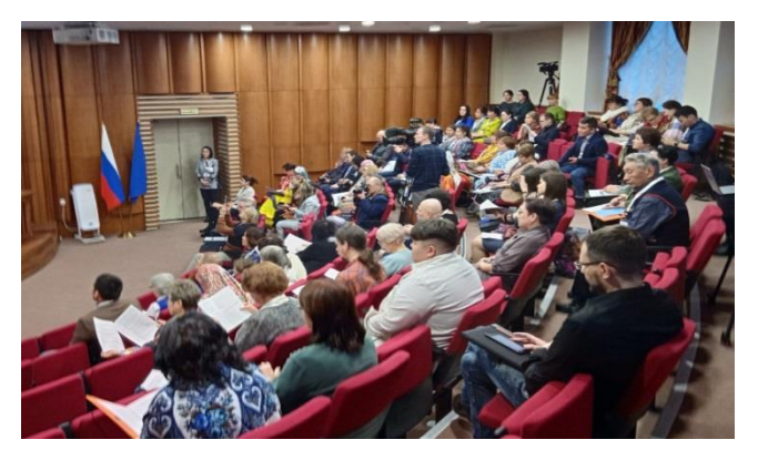
Fig. 12. Participants of the conference in Salekhard "Civilization — North: languages and cultures of indigenous peoples of the North" (Salekhard, October 30–November 2, 2022).