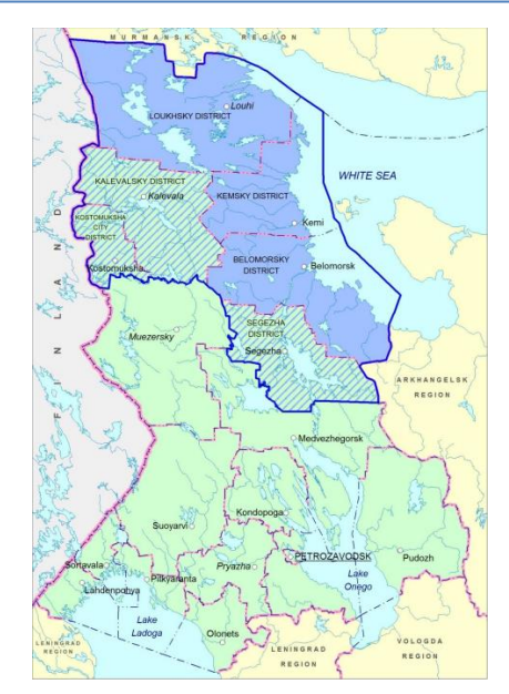
Fig. 1. Municipalities of the Karelian Arctic<sup>1</sup>.

The Karelian Arctic, with an area of 71.4 thousand km<sup>2</sup> or 40% of the RK territory (Table 1), is characterized by low and extremely low population density (the exceptions are the Kostomuksha urban district and the Segezhskiy district). Less than a fifth of the inhabitants of the region (18.3%) live here, the urbanization of most municipalities is also below the average Karelian values (81.2%).