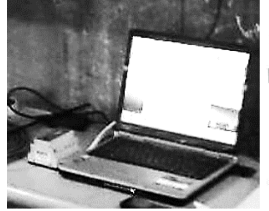
(a) Matching device

Бюллетень науки и практики / Bulletin of Science and Practice https://www.bulletennauki.com