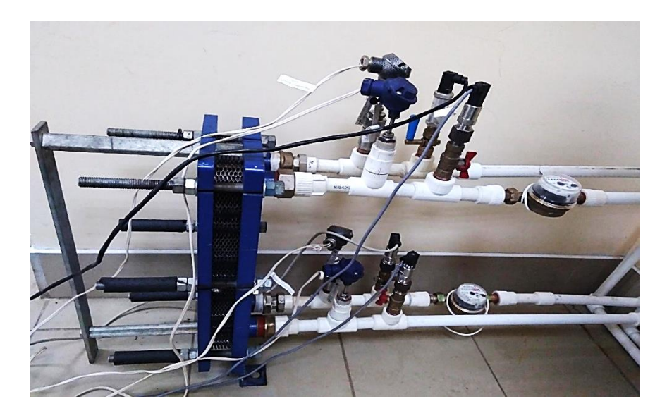
Figure 2. The experimental setup photo's.