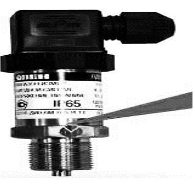
(b) Pressure transmitter PD100

CIB-15 EET-A-D.814-10<sup>4</sup> m<sup>3</sup>/mp 90° 2<sup>97</sup> 2<sup>97</sup> 2<sup>97</sup> 7 0<sub>1</sub>=1,5m<sup>3</sup>/m H-8 VA 0 0 0 0 0 44 4 7 3 -