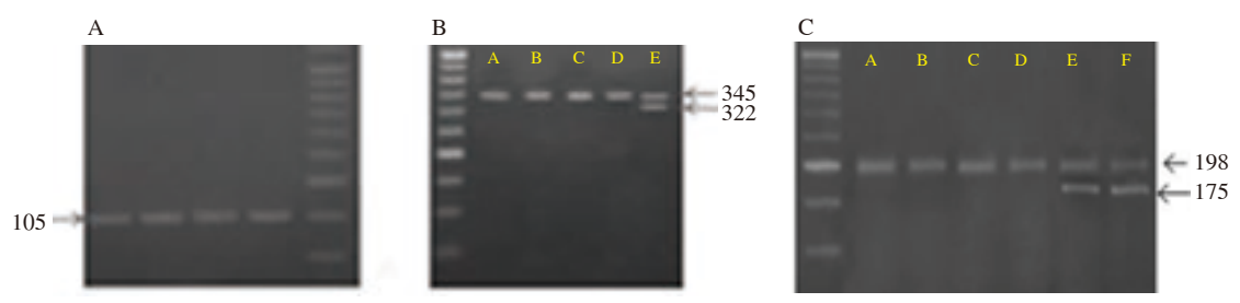
Figure 2. Electrophoretic pattern of thrombophilic mutations after PCR-RFLP. (A) FVL, All lanes are wild type (G1691A). (B) FII, Lanes A-D are wild type, lane E shows 345 and 322 bp, indicating heterozygous FII mutation (G20210A). (C) MTHFR, Lanes A-D are wild type, lanes E and F show 198 and 175 bp, indicating heterozygous MTHFR mutation (C677T).

<sup>&</sup>Mann–Whitney U is used and data are expressed as median (IQR); <sup>#</sup> t -test is used and data are expressed as mean±SD; <sup>*</sup> Chi -square test is used and data are expressed as n(%). Group A (n=43) takes unfractionated heparin 5000 IU twice a day through subcutaneous injection; Group B (n=43) does not take any antithrombotic drugs. BMI: body mass index; FSH: follicular stimulating hormone; E<sub>2</sub>: estradiol; IVF: in vitro fertilization.