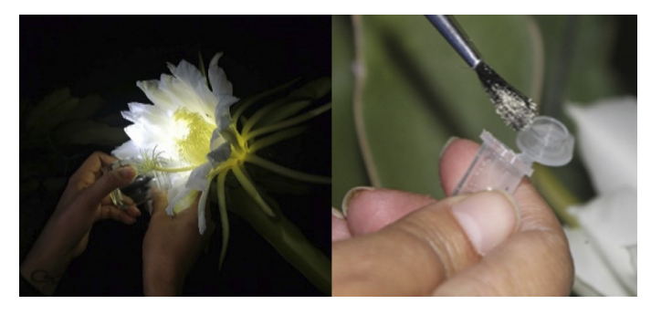
Fig- 1A. Collection of pollen from H. undatus flowers during anthesis. Fig.

and close the next morning. Pollen was collected every hour from 19:00 to 07:00 the following day, detaching the grains from the anthers (Figure 1A). Pollen collection was stopped at 07:00 am because the flowers began to deteriorate showing signs of wilting and damage to the petals, which indicates that they were either pollinated or senescent without having received pollen.