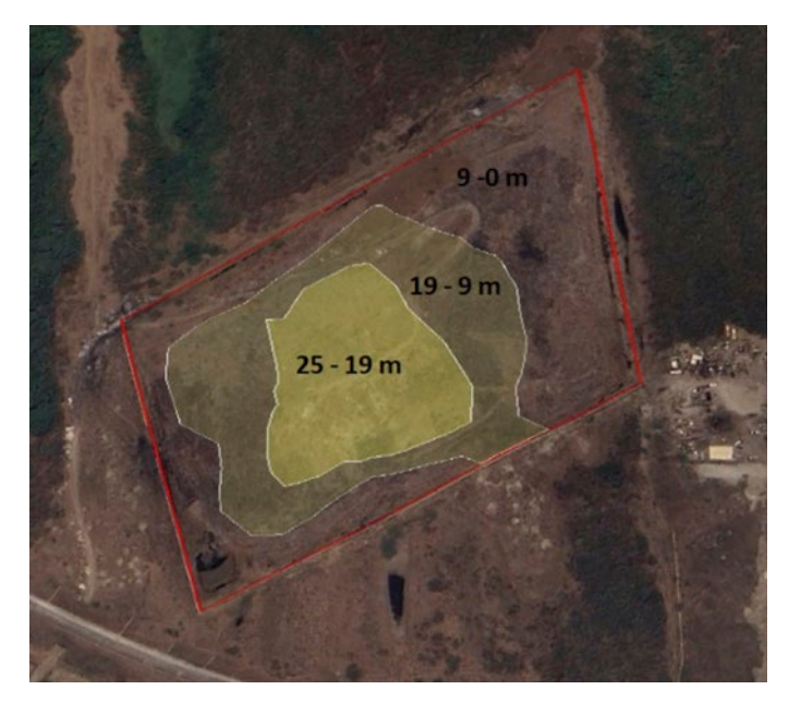
Fig. 4. Level layers of Abandoned Landfill of Municipality of Veracruz, Veracruz State, Mexico in the year 2023.

By using layers of different heights determined from the Google Earth image of August 5, 2023, it can be seen that the shape of the abandoned landfill is like a truncated pyramid, three zones of different heights can be identified (Figure 4).