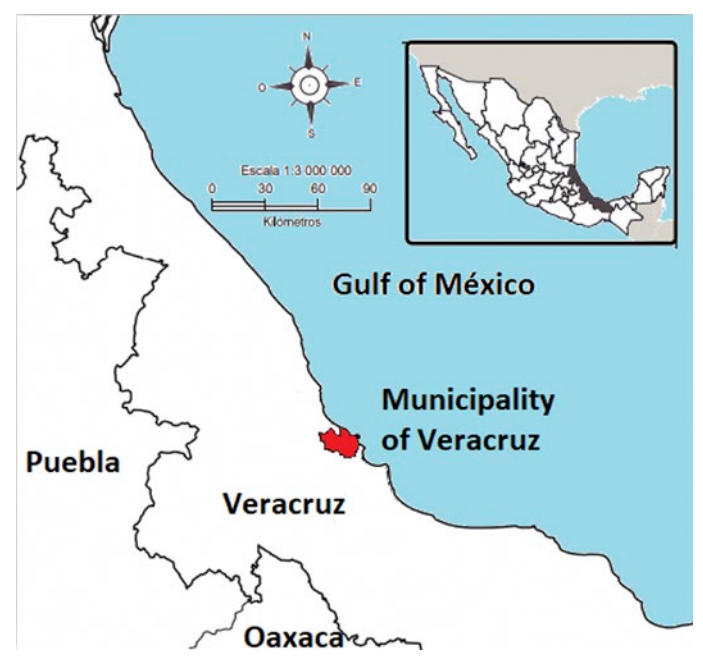
Fig. 1. Municipality of Veracruz, Veracruz State, Mexico.

The municipality of Veracruz is located in the central part of the State of Veracruz, in the Sotavento Region on the coast of the Gulf of Mexico, it has 297 km2 (0.3% of the state territory) and 607 209 inhabitants which represents 7.5% of the state total and with the municipalities of Boca del Río, Medellín and Alvarado form as a whole the most metropolitan area in the state populated metropolitan area in the State of Veracruz with 939 046 inhabitants [19] (Fig. 1).