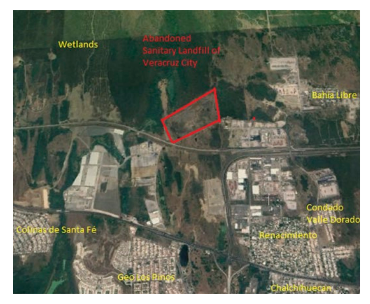
Fig. 3. Abandoned Landfill of Municipality of Veracruz, Veracruz State, Mexico in the year 2002, with cell 1 and cell 2 closed and cell 3 in use.

The Abandoned Landfill in the city of Veracruz was designed for a useful life of 10 years. However, it continued in operation until it collapsed and all the existing infrastructure (biogas wells, leachate lagoon, etc.) was covered with waste, so its final area is 167 228 m<sup>2</sup> [13]. And in accordance with the NOM-083-SEMARNAT-2003 can be considered as a Controlled Final Disposal Site [7].