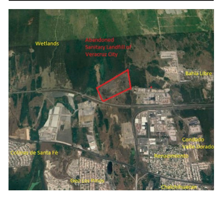
Fig. 2. Abandoned Landfill of Municipality of Veracruz, Veracruz State, Mexico and its nearby neighborhoods.