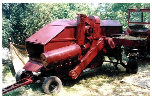
Fig. 2 - Thresher lateral view

The material separated, resulted by threshing process was collection in a matrix (10x5) of collecting boxes, the dimensions of every box having (L x I x h): 200x200x100 [mm], numbered from 1 to 10 along the length, respectively: A, B, C, D, E on the width.