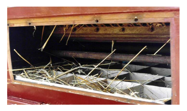
Fig. 3 - Collecting box with separated material

The material on the tarpaulin was handled carefully manually, being divided into evacuated straw sections, unthreshed ears (threshing losses), and threshed and unseparated seeds (separation losses). For each test, to measure the moisture of the straw parts, a sample was collected from the evacuated straw parts.