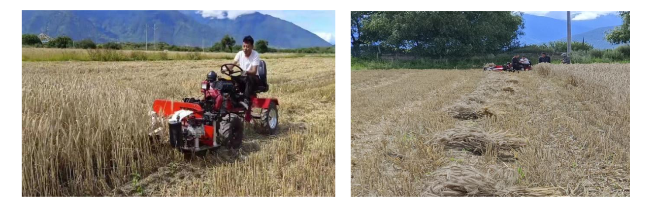
Fig. 3 – Field operation

For operation, as shown in Figure 3, the highland barley stalk is cut down by the cutting mechanism of the binding machine, it is transported from the right side of the cutting platform to the left side through the picking teeth of the conveyor chain, and enters the baling device. The driving wheel of the baling device continuously rotates, and the highland barley rod transported by the picking teeth is transferred to the baling mechanism through the collecting and compression mechanism, and the retaining rake is continuously squeezed ( Wang Bao'ai, 2020 ). When the accumulated highland barley rod reaches a certain amount. The stop pull rod of the baling mechanism is removed to complete a baling cut, and then the above work content is repeated to enter the next working cycle. The binding machine can complete the cutting of highland barley stalk in one workflow. When working, the parts operate flexibly, and the rotating parts have safety tips and protective covers. The baling effect of highland barley harvesting is shown in Figure 4. The main parameters of the highland barley harvesting and binding machine are shown in Table 1.