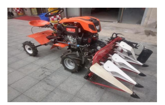
Fig. 1 – Overall highland barley harvesting and binding machine Fig. 2 – Appearance

For operation, as shown in Figure 3, the highland barley stalk is cut down by the cutting mechanism of the binding machine, it is transported from the right side of the cutting platform to the left side through the picking teeth of the conveyor chain, and enters the baling device. The driving wheel of the baling device continuously rotates, and the highland barley rod transported by the picking teeth is transferred to the baling mechanism through the collecting and compression mechanism, and the retaining rake is continuously squeezed ( Wang Bao'ai, 2020 ). When the accumulated highland barley rod reaches a certain amount. The stop pull rod of the baling mechanism is removed to complete a baling cut, and then the above work content is repeated to enter the next working cycle. The binding machine can complete the cutting of highland barley stalk in one workflow. When working, the parts operate flexibly, and the rotating parts have safety tips and protective covers. The baling effect of highland barley harvesting is shown in Figure 4. The main parameters of the highland barley harvesting and binding machine are shown in Table 1.