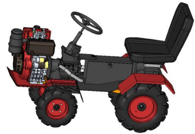
Fig. 6 - Highland barley harvesting baler walking chassis 3 D general map

Under the action of the steering cylinder, the hinged shaft of the rear frame rotates to drive the subsequent steering, so as to realize the steering of the entire integrated machine. The chassis and walking system of the machine are shown in Figure 6 below.