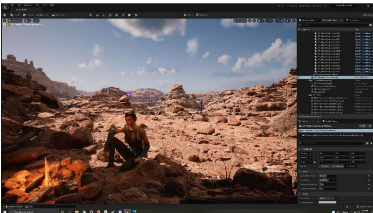
Figure 2. Unity engine interface

Unreal Engine is a popular game engine developed by Epic Games that is used by game developers to create high-quality, AAA games for a range of platforms, including consoles, PCs, and mobile devices (Lee, 2016; Satheesh, 2016). The engine is known for its advanced graphics capabilities, powerful tools, and flexibility (figure 2).